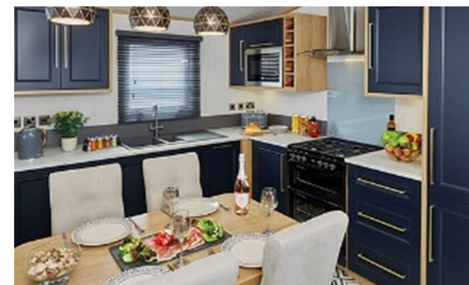
Aspen Corner Brokerswood, Westbury BA13 4EH